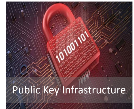
Public Key Infrastructure