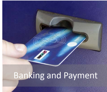
Banking and Payment